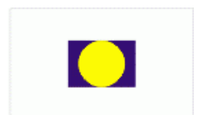
Flag of Wirtland

Wirtland is an internet-based sovereign state, an experiment into legitimacy and self-sustainability of a country without its own soil. Wirtland was founded on August 14, 2008 as a public initiative. Its population is currently approximately 700 citizens from all five continents. It is represented through its official website www.Wirtland.com , its social network www.wirtland.net , and "The Times of Wirtland" at http://wirtland.blogspot.com . Currently Wirtland is governed by chancellor, and aims to become a parliamentary democracy. For more information about Wirtland, please visit: www.Wirtland.com .